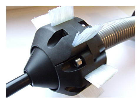
2) Fit the rear Skid Set