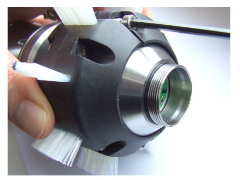
1) Fit Skid Set to the T812 Camera body