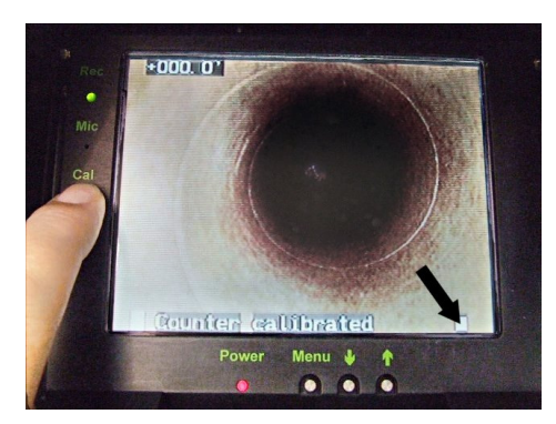
5) Wait until the 'ready' symbol (white square) is shown on the screen