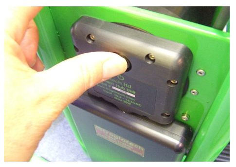
4) Switch the T804 ON