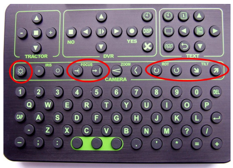
6) Use the controls ringed above to control the camera