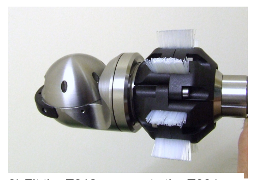
3) Fit the T812 camera to the T804 termination